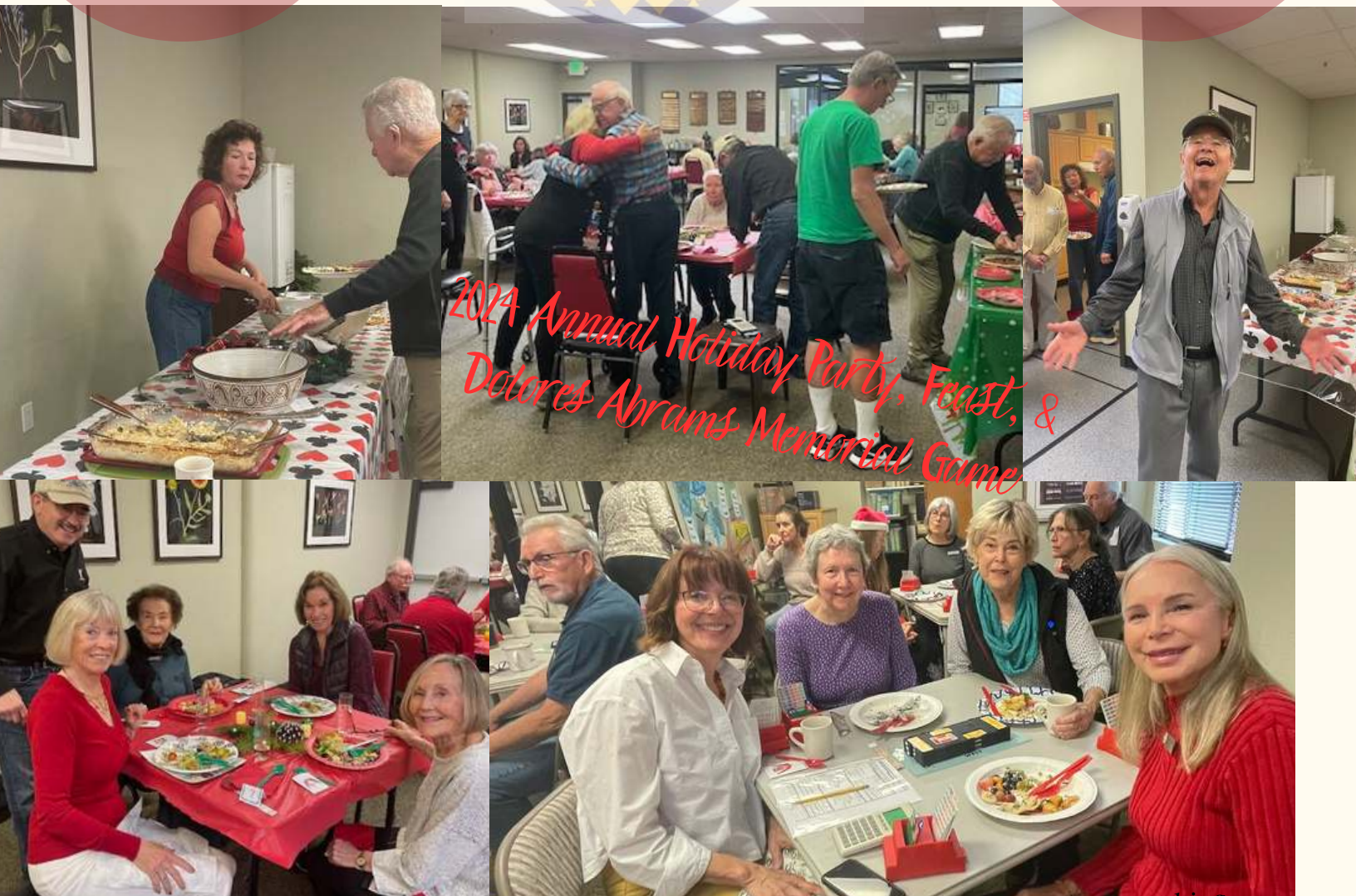
2024 Annual Holiday Party, Feast, & Dolores Abrams Memorial Game